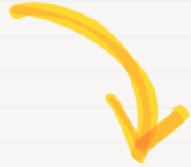
Table of Contents!